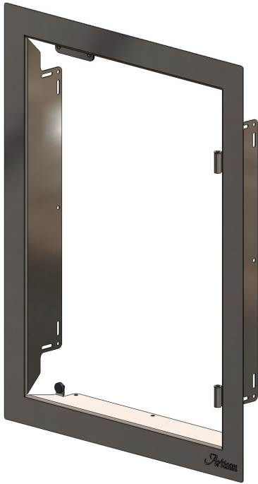
DOOR FRAME 510-1332