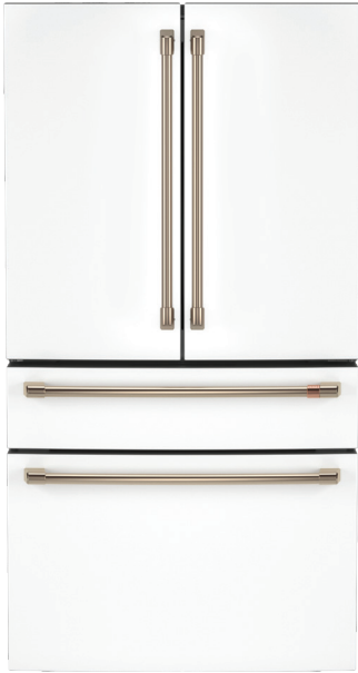
CGE29DP4TW2 Matte White with Brushed Bronze handles