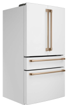
CKQBLSFNW2 Matte White Side Panel (left)