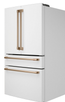
CKQBRSFNW2 Matte White Side Panel (right)