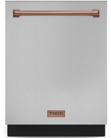
ROSE GOLD DW24X8BA99-RSG