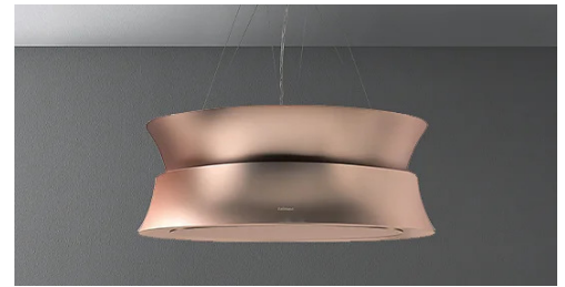
Photograph is for information purposes only. May not correspond to the selected version