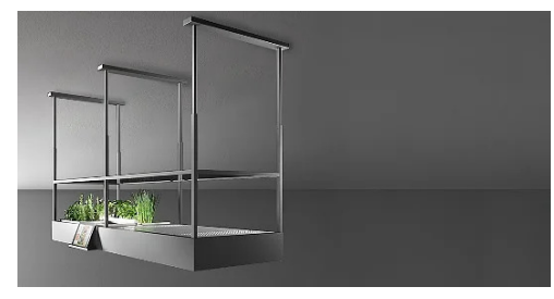
Photograph is for information purposes only. May not correspond to the selected version

Packaging dimensionsL 75 x H 15 x D29 in