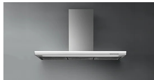
Photograph is for information purposes only. May not correspond to the selected version

Materials/Finishes Scotch brite stainless steel (AISI 304) Technology SRS Speed reduction system Features LED ambient light Control Electronic control Ducting type Extracting/Filtering Installation type Island Lighting LED Filters Air Falmec filter for balanced suction Charcoal filter (optional) Ducting type Dimensions 36 in Minimum Electric hob distance 21 in Minimum Gas hob distance 25 in Notes Recommended mounting height from cooking surface to hood bottom: 24" - 35"; Carbon.zeo filter kit: KACL.949#IF Ceiling carbon.zeo KACL.934