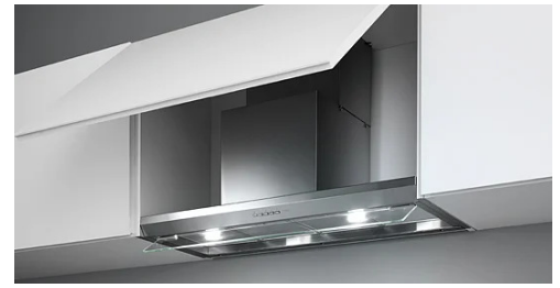
Photograph is for information purposes only. May not correspond to the selected version

Materials/Finishes Scotch brite stainless steel Technology SRS Speed reduction system Features Slide out glass panel Automatic shut-off timer Clean filter reminder Control Electronic control Ducting type Extracting/Filtering Chimney Possible to duct wall mounted from rear Installation type Insert Lighting LED 2x1,2 W - 2700 K / 5600 K Filters Metallic grease filter, removable and washable Charcoal filter (optional) Ducting type Dimensions 36 in Notes Availability Carbon.Zeo filter KACL.1039 for hoods produced from Sept. 2024