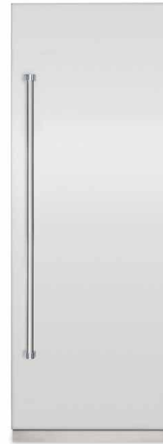
Shown with optional stainless steel door panel kit