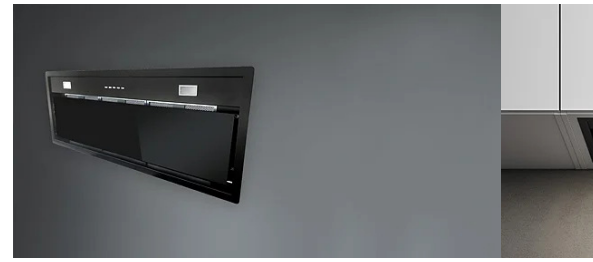
Photograph is for information purposes only. May not correspond to the Photograph is selected version

Materials/Finishes Black tempered glass Features Perimeter suction Bottom flush SRS Speed reduction system Control Electronic control Remote control (optional) Ducting type Extracting/Filtering Installation type Insert Lighting Led 2x1,2 W - 3200 K Filters Metallic grease filter, removable and washable Ducting type Dimensions 28 in Minimum Electric hob distance 10 in Minimum Gas hob distance 9 in Notes Cut-out size: 10 5/16" (262) x 29 9/16" (751) Recommended mounting height from cooking surface to hood bottom: 24" - 36"