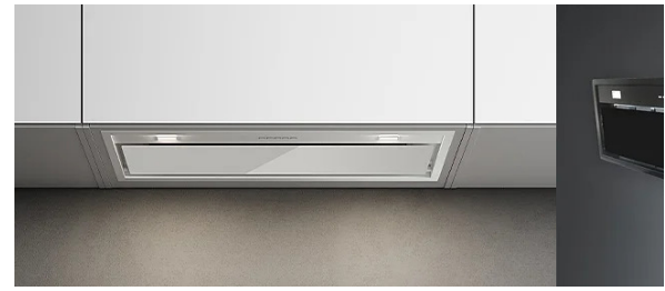
Photograph is for information purposes only. May not correspond to the Photograph is selected version

Materials/Finishes White tempered glass Features Perimeter suction Bottom flush SRS Speed reduction system Control Electronic control Remote control (optional) Ducting type Extracting/Filtering Installation type Insert Lighting Led 2x1,2 W - 3200 K Filters Metallic grease filter, removable and washable Ducting type Dimensions 28 in Minimum Electric hob distance 10 in Minimum Gas hob distance 9 in Notes Cut-out size: 10 5/16" (262) x 29 9/16" (751) Recommended mounting height from cooking surface to hood bottom: 24" - 36"