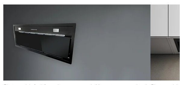
Photograph is for information purposes only. May not correspond to the Photograph is selected version

Packaging dimensionsL 34 x H 15 x D15 in