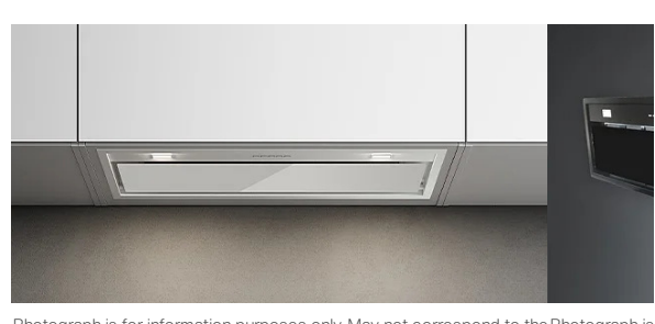
Photograph is for information purposes only. May not correspond to the Photograph is selected version

Packaging dimensions L 34 x H 15 x D15 in