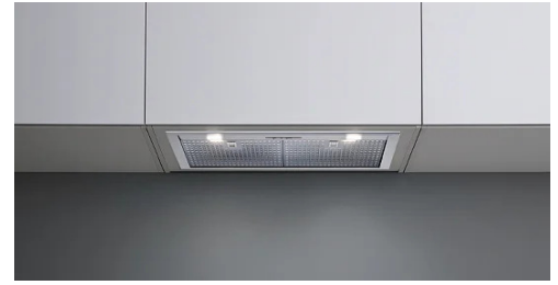
Photograph is for information purposes only. May not correspond to the selected version

Recommended mounting height from cooking surface to hood bottom: 24" - 36"