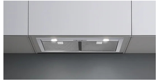
Photograph is for information purposes only. May not correspond to the selected version

Gross weight 20 lbs Net weight 14 lbs Volume 4 ft Packaging dimensions L 26 x H 15 x D16 in