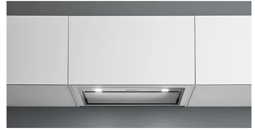
Photograph is for information purposes only. May not correspond to the selected version

Materials/Finishes Scotch brite stainless steel Technology SRS Speed reduction system Features Perimeter suction Control Electronic control Remote control (optional) Ducting type Extracting/Filtering Installation type Insert Lighting Led 2x1,2 W - 3200 K Filters Metallic grease filter, removable and washable Charcoal filter (optional) Ducting type Dimensions 28 in Minimum Electric hob distance 21 in Minimum Gas hob distance 25 in Notes Cut-out size: 10 5/16" (262) x 26 1/4" (666)