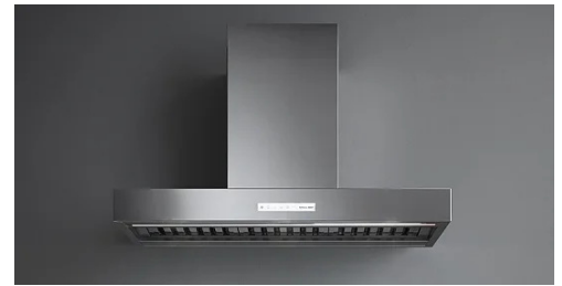
Photograph is for information purposes only. May not correspond to the selected version

Materials/Finishes Scotch brite stainless steel (AISI 304) Technology NRS technology for a quieter kitchen Control Touch control + leaf sensor Ducting type Extracting/Filtering Installation type Wall Lighting LED 3x1,2 W - 3200 K Filters Professional Baffle Filters Ducting type Dimensions 36 in Minimum Electric hob distance 25 in Minimum Gas hob distance 21 in Notes Recommended mounting height from cooking surface to hood bottom: 24" - 35"