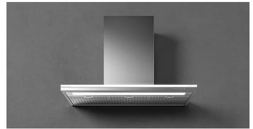
Photograph is for information purposes only. May not correspond to the selected version

Materials/Finishes Scotch brite stainless steel (AISI 304) Technology NRS technology for a quieter kitchen SRS Speed reduction system Control Electronic control Ducting type Extracting/Filtering Installation type Island Lighting Strip led (4000K) Filters Air Falmecc filter for balanced suction Combined regenerable Carbon.Zeo filter (optional) Ducting type Dimensions 36 in Minimum Electric hob distance 21 in Minimum Gas hob distance 25 in Notes Availability Carbon.Zeo filter KACL.1039 for hoods produced from Sept. 2024