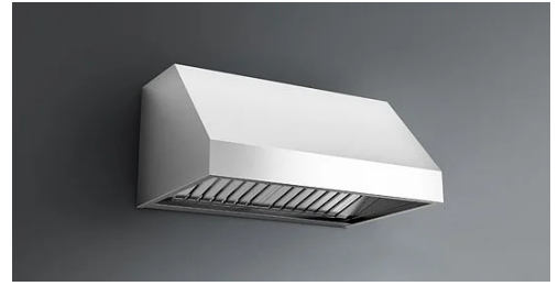
Photograph is for information purposes only. May not correspond to the selected version