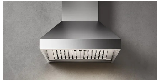
Photograph is for information purposes only. May not correspond to the selected version

Packaging dimensions L 53 x H 32 x D29 in