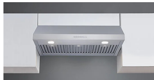
Photograph is for information purposes only. May not correspond to the selected version

Gross weight 42 lbs Net weight 34 lbs Volume 8 ft Packaging dimensions L 38 x H 15 x D26 in