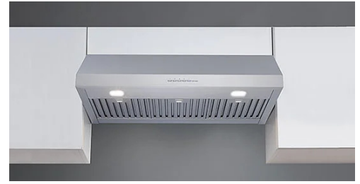
Photograph is for information purposes only. May not correspond to the selected version

Materials/Finishes Scotch brite stainless steel Technology SRS Speed reduction system Features Automatic shut-off timer Clean filter reminder Control Electronic control Ducting type Extracting/Filtering Installation type Insert Filters Professional Baffle Filters Ducting type Dimensions 36 in Notes Recommended mounting height from cooking surface to hood bottom: 24" - 35"