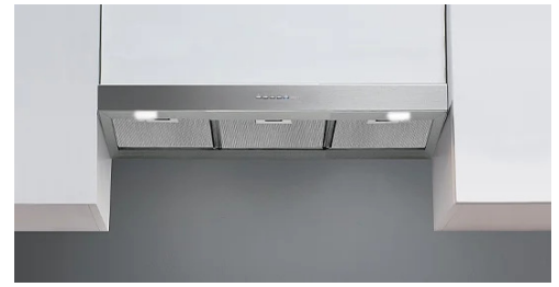
Photograph is for information purposes only. May not correspond to the selected version

Materials/Finishes Scotch brite stainless steel Control Mechanical control Ducting type Extracting/Filtering Installation type Insert Lighting Led 2x1,2 W - 3200 K Filters Metallic grease filter, removable and washable Charcoal filter (optional) Ducting type Dimensions 30 in Minimum Electric hob distance 21 in Minimum Gas hob distance 25 in Notes Active Carbon filter: FFCHASQC0BL