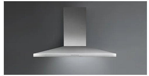
Photograph is for information purposes only. May not correspond to the selected version

Materials/Finishes Scotch brite stainless steel Technology SRS Speed reduction system Features Clean filter reminder Control Electronic control Ducting type Extracting/Filtering Installation type Wall Lighting Led 2x1,2 W - 3200 K Filters Charcoal filter (optional) Labyrinth filter Ducting type Dimensions 30 in Minimum Electric hob distance 21 in Minimum Gas hob distance 24 in Notes Recommended mounting height from cooking surface to hood bottom: 24" - 35"