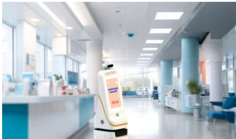
Hospitals, nursing homes, physical examination centers, beauty salons and other services