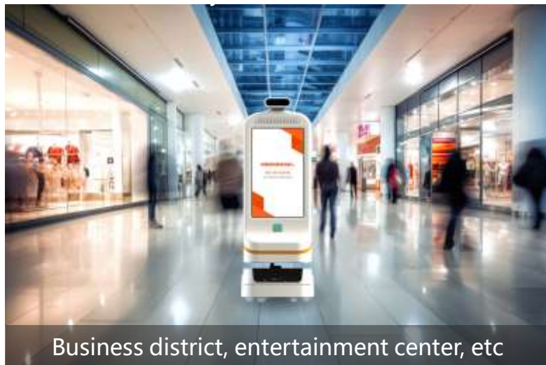
Business district, entertainment center, etc