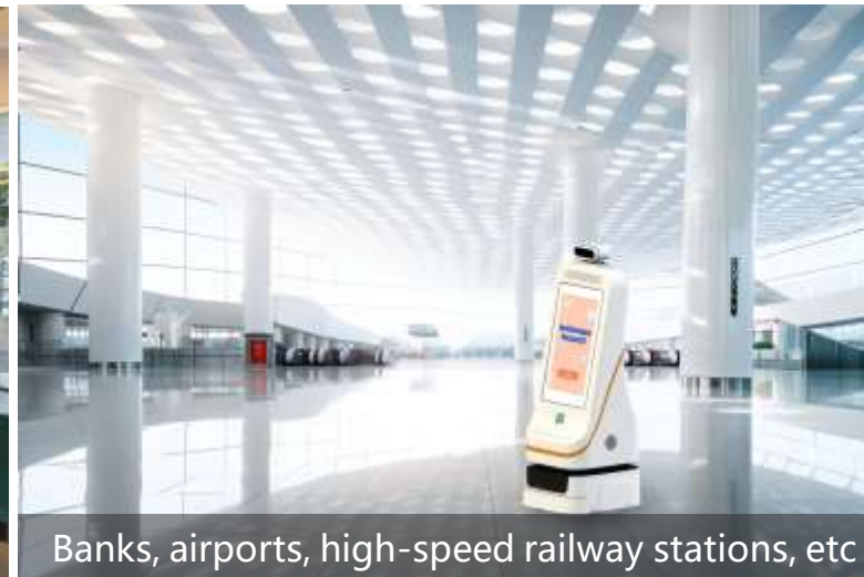
Banks, airports, high-speed railway stations, etc