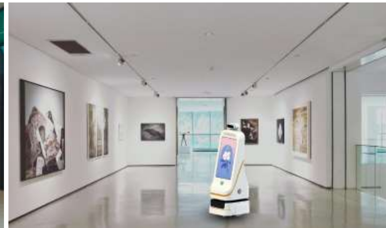
Exhibition hall, exhibition hall