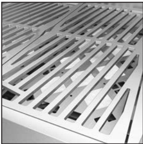
Laser Cut Stainless Steel Grate - 5/16" thick