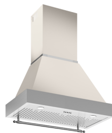
K36HERTX + KC36HERTAV Ivory gloss canopy