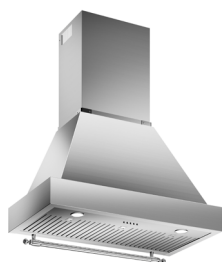
K36HERTX + KC36HERTX Stainless steel canopy