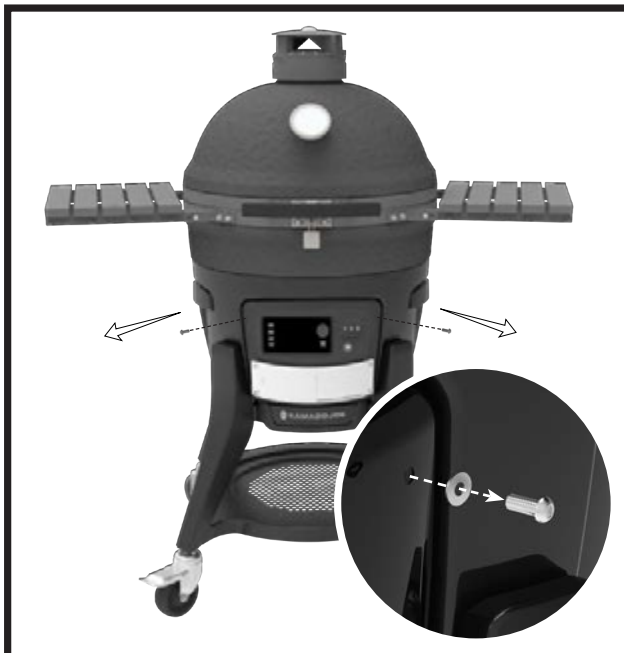
Remove two screws from front module.