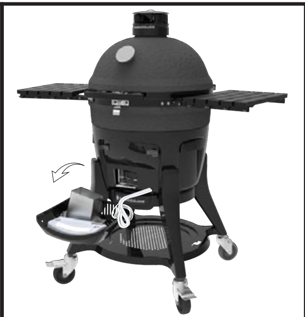
Remove front module.