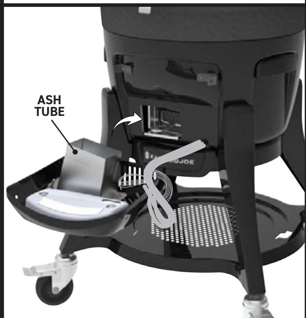
Repeat the steps in reverse order to install the new front module. (Note - when reinstalling the front module, be sure the ash tube is fully seated in the grill body).