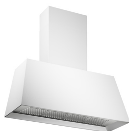
KMC48BI Matt white canopy