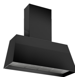
KMC48NE Matt black canopy