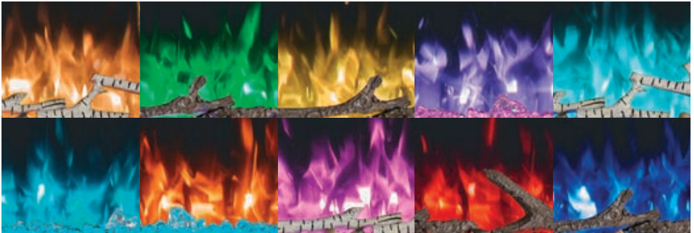
10 flame color options and 10 ember bed color options with cycle mode