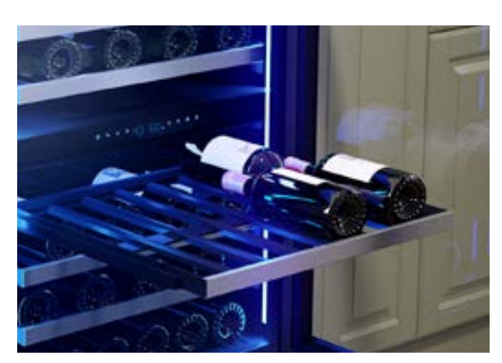
Full-Extension Wood Racks