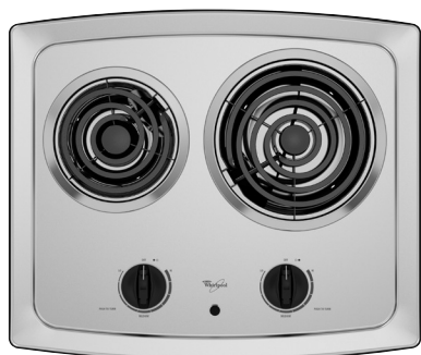
Stainless Steel RCS2012RS