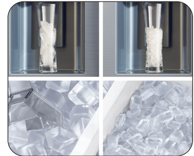
Refrigerator: Curved and Crushed Ice Freezer: Cubed and Ice Bites™