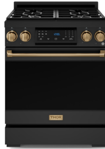
BRONZE RSG30B-BRZ / RSG30BLP-BRZ