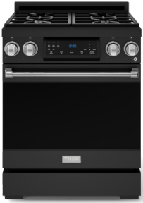
STAINLESS STEEL RSG30B-SS / RSG30BLP-SS