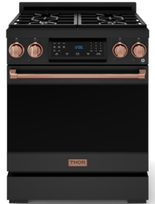
ROSE GOLD RSG30B-RSG / RSG30BLP-RSG