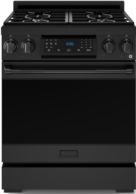
Product: Gordon Ramsay by THOR Kitchen 30 Inch Professional Gas Range with Tilt Panel Touch Control In Matte Black In Natural Gas/ Liquid Propane Model Number: RSG30B/RSG30BLP