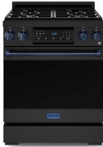
BLUE RSG30B-BLU / RSG30BLP-BLU