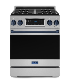
BLUE RSG30-BLU / RSG30LP-BLU