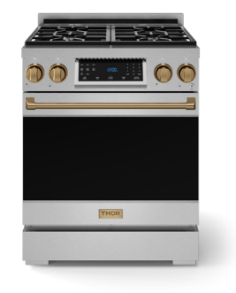
BRONZE RSG30-BRZ / RSG30LP-BRZ