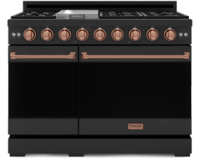
ROSE GOLD RSG48EB-RSG / RSG48EBLP-RSG