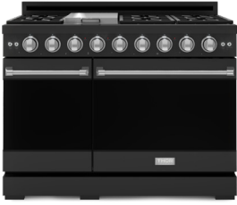
STAINLESS STEEL RSG48EB-SS / RSG48EBLP-SS