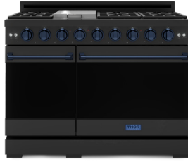
BLUE RSG48EB-BLU / RSG48EBLP-BLU