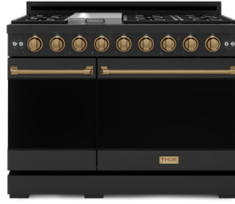
BRONZE RSG48EB-BRZ / RSG48EBLP-BRZ