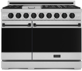
BLACK RSG48E-BLK / RSG48ELP-BLK