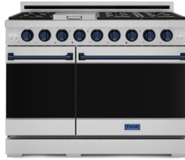
BLUE RSG48E-BLU / RSG48ELP-BLU