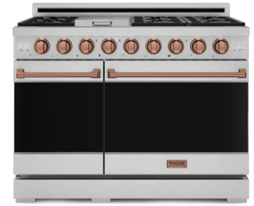
ROSE GOLD RSG48E-RSG / RSG48ELP-RSG