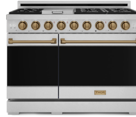
BRONZE RSG48E-BRZ / RSG48ELP-BRZ