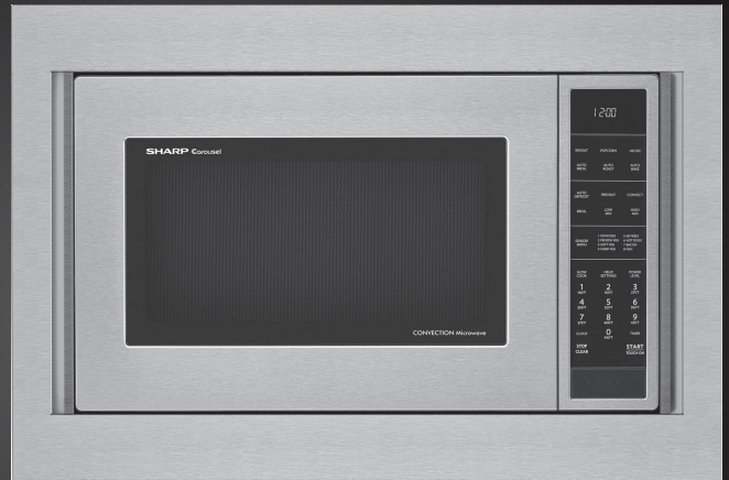
SMC1585BS Convection Microwave Oven with the RK94S30F Trim Kit

Includes Ducting, Finish Trim, and Easy-to-Follow Instructions