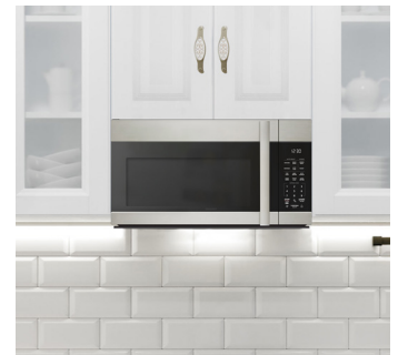
The sleek edge-to-edge stainless steel and black glass design is an elegant look to your kitchen

Product specifications and design are subject to change without notice.