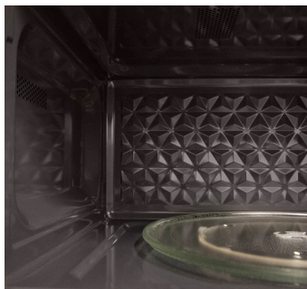
Stylish Gray Interior

The Sharp® SMO1754JS features a powerful 2-speed ventilation system and easy-to-reach, easy-to-replace filters. With decades of experience designing innovative cooking appliances, it's easy to see why cooks around the world trust Sharp.