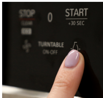
Premium LED Interior and Cooking Surface Lighting