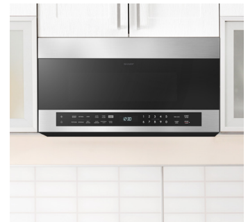
The sleek edge-to-edge stainless steel and black glass design is an elegant look to your kitchen

Product specifications and design are subject to change without notice.