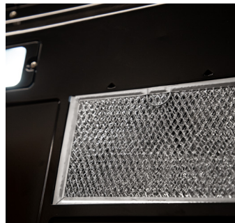
Easy-to-access, slide-out Grease Filters allow for effortless, hassle-free replacement