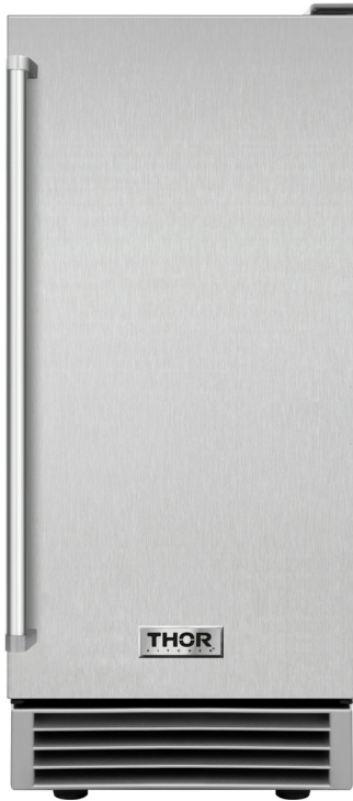
Product: 15 Inch Built-In Ice Maker in Stainless Steel Model Number: TIM1501