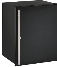
BLACK SOLID (LOCK)