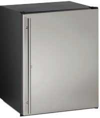
STAINLESS SOLID (LOCK)