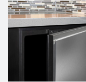
Stainless Handleless Panel