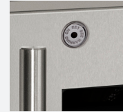
Stainless Lock Model