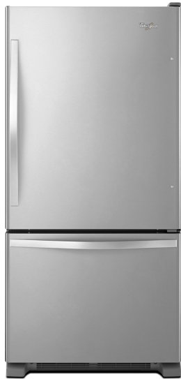
Monochromatic Stainless Steel WRB322DMB