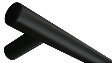
Designer Style Handle Included