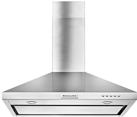
Stainless Steel KVWB406DSS