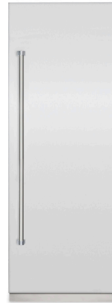
Shown with optional stainless steel door panel kit