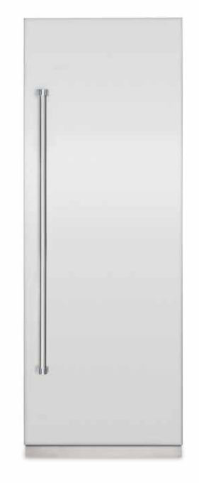
Shown with optional stainless steel door panel kit