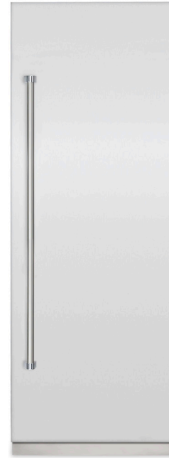
Shown with optional stainless steel door panel kit