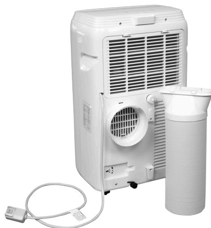
ZCP08SA, ZCP10SA, ZCP12SA