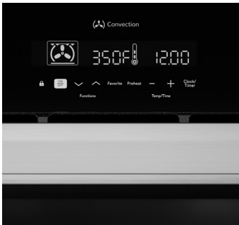
The glass touch control panel is easy to see and operate

With decades of experience designing innovative cooking appliances, it's easy to see why cooks around the world trust Sharp.