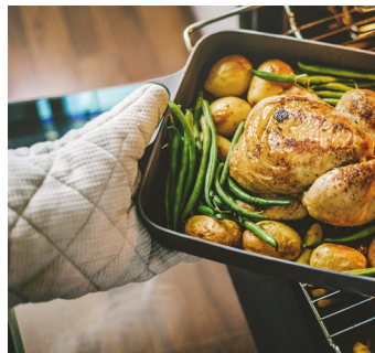
The included glide-rack allows for removing even the heaviest dishes