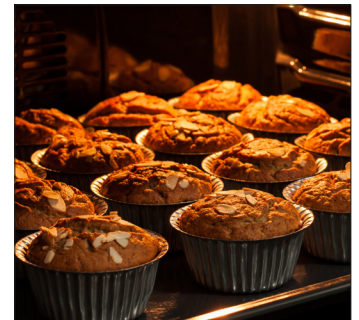
Keep an eye on your food from the outside with bright, halogen lighting

SHARP ELECTRONICS CORPORATION 100 Paragon Drive, Montvale NJ, 07645 1.800.237.4277 • www.sharppusa.com